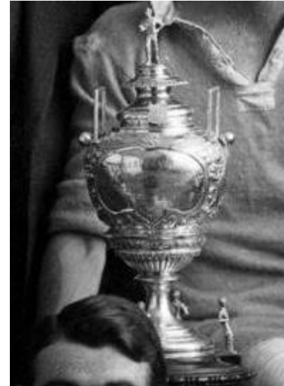
Tristram Shield and Charity Cup