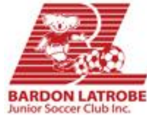
The club mascot