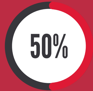
50% increase in womens since 2020

The committee understands the importance of maintaining a sense of community amongst our members. We value each and every member's contribution to our club, and we want to ensure that everyone has the opportunity to participate in our events and programs.