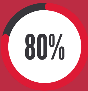
Junior or miniroos

A total of 1,009 playing members were registered at the club in 2023 (2022 in brackets): Kindy Soccer 38 (30) MiniRoos 693 (658), Juniors 83 (76) and Seniors 195 (203). This season also saw an increase in female teams from 12 in 2022 to 15 in 2023.